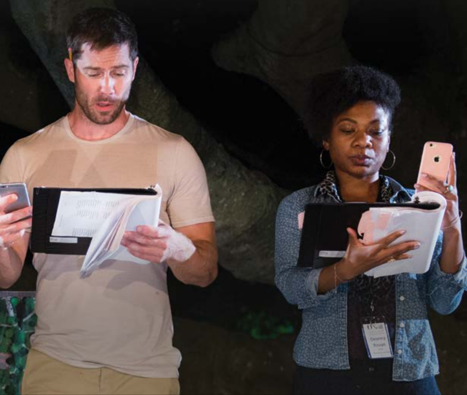
FRONT COVER: Eastern Connecticut Ballet BACK COVER: Eugene O'Neill Theater Center - National Playwrights Conference