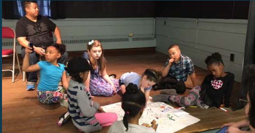
Riverfront kids and staff working on the set