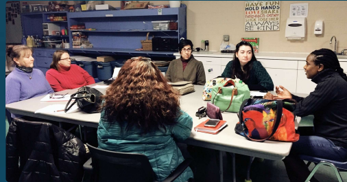
Emerson Theater Collaborative meets with Riverfront and The Light House